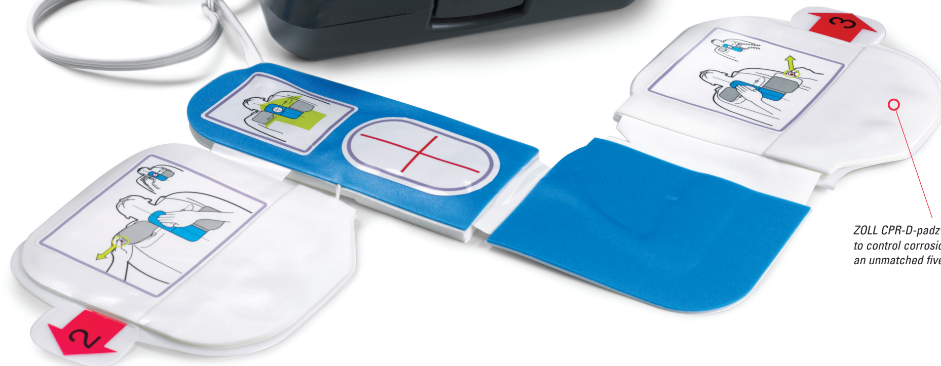
ZOLL CPR-D-padz® are designed to control corrosion and allow for an unmatched five-year lifespan.

"A strong emphasis on delivering high-quality chest compressions remains essential: rescuers should push hard to a depth of at least 2 inches (or 5 cm) at a rate of at least 100 compressions per minute, allow full chest recoil, and minimize interruptions in chest compressions." 3