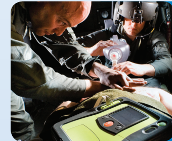
Rugged and reliable, the AED Pro can withstand the demanding environments and mission requirements military professionals face every day. It serves double-duty as a portable defibrillator and monitor you can depend on in the field.

Whether in the field or in a clinical setting, the AED Pro provides the right combination of support and services to help ensure a patient's safety and help improve a patient's chances of survival in critical situations.