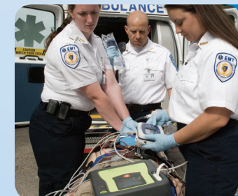
EMS supervisors and command vehicles, firefighters, and bike medics appreciate this portable, lightweight, compact, and durable device for its BLS and ALS monitoring as well as its capabilities as a defibrillator.