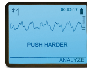
If your CPR chest compressions are too shallow, you will be prompted to "Push Harder."