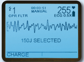
See-Thru CPR filters out compression artifact, which reduces the amount of time without compressions while checking to see whether an organized, shockable rhythm has developed.

See-Thru CPR® filters out compression artifact ("noise") so you can see the patient's underlying cardiac rhythm (ECG) while performing CPR. Pauses are inevitable, but reducing the amount of time without compressions results in a higher chest compression fraction (CCF), the proportion of time spent delivering compressions during CPR. A higher CCF predicts better survival to discharge in patients who experience out-of-hospital cardiac arrest.*