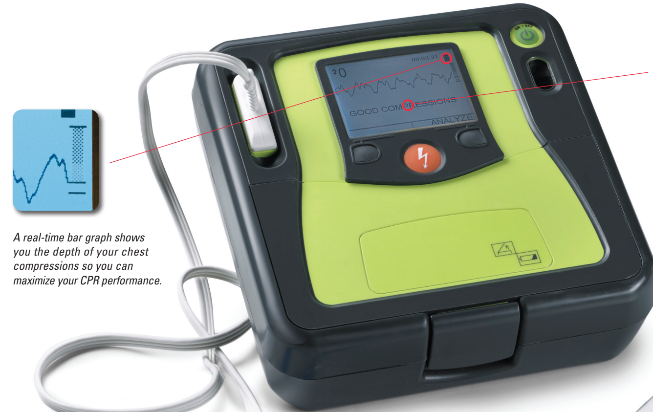
A real-time bar graph shows you the depth of your chest compressions so you can maximize your CPR performance.

According to the American Heart Association 2010 Guidelines, "real-time CPR prompting and feedback technology such as visual and auditory prompting devices can improve the quality of CPR." The ZOLL® AED Pro® provides the feedback both the professional and the lay rescuer need to perform optimal CPR.