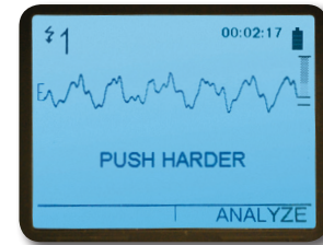
If your CPR chest compressions are too shallow, you will be prompted to "Push Harder."

A screen display as well as a metronome guide you with visual and audible prompts to achieve consistent compression levels. High-quality compressions are reinforced with a "Good Compressions" message.