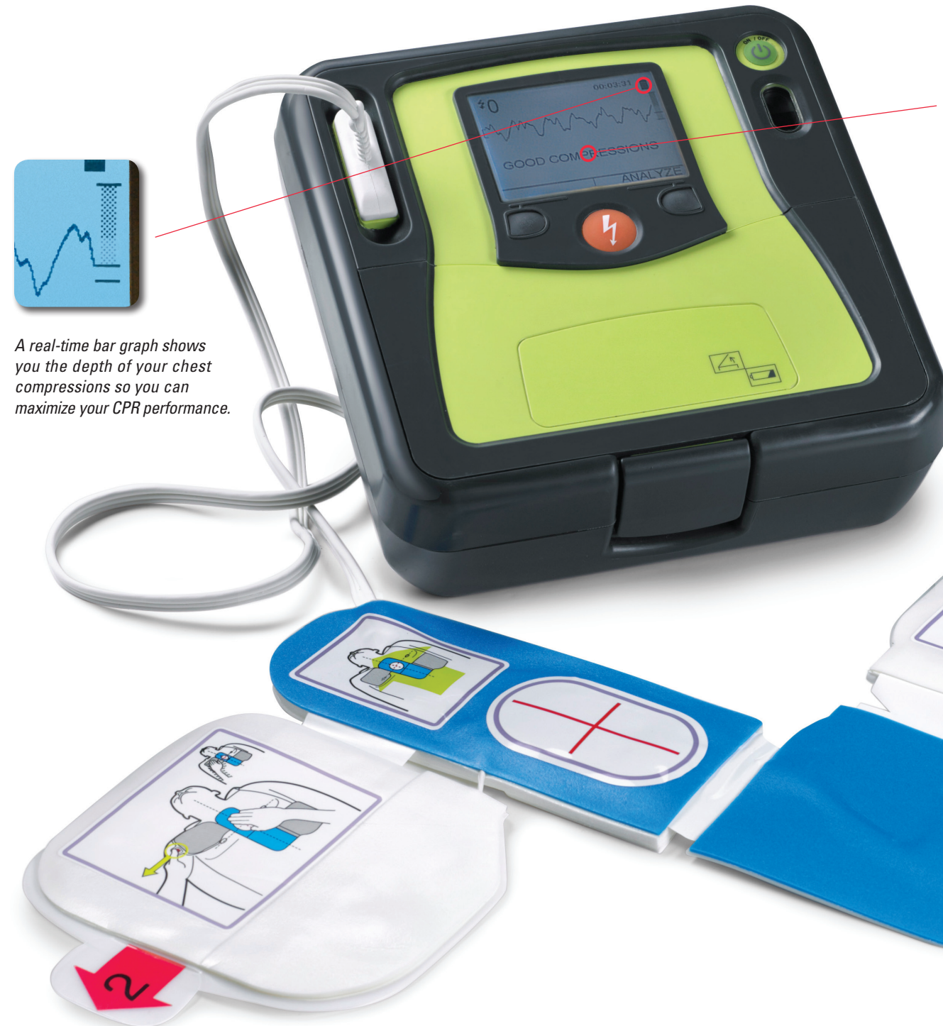
A real-time bar graph shows you the depth of your chest compressions so you can maximize your CPR performance.

According to the American Heart Association 2010 Guidelines, "real-time CPR prompting and feedback technology such as visual and auditory prompting devices can improve the quality of CPR." 1 The ZOLL® AED Pro® provides the feedback both the professional and the lay rescuer need to perform optimal CPR.